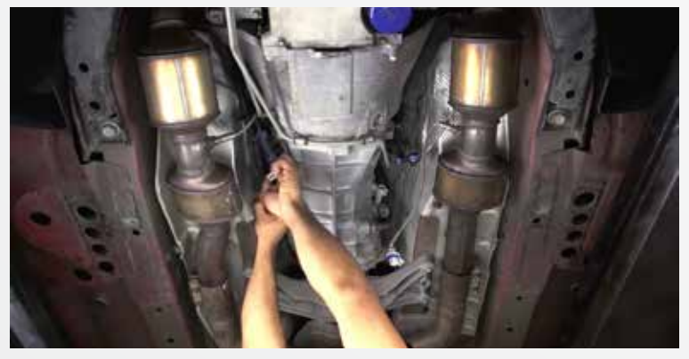
Loosen the clamps on the rear of the cat pipes and unplug the oxygen sensors at the transmission. Remove the flanged nuts at the collectors of the stock manifolds.

Remove the spark plug wires, spark plugs, and dipstick tube. Unplug the oxygen sensors at the back of the engine. Jack the car up and support on jack stands.