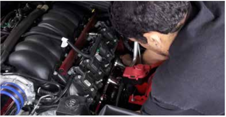
Position the cat pipes into the rear barrel clamps and up to the headers and install the provided 12 point head 10mm bolts. Tighten the collector bolts tight, then tighten the rear barrel clamps on the exhaust pipes