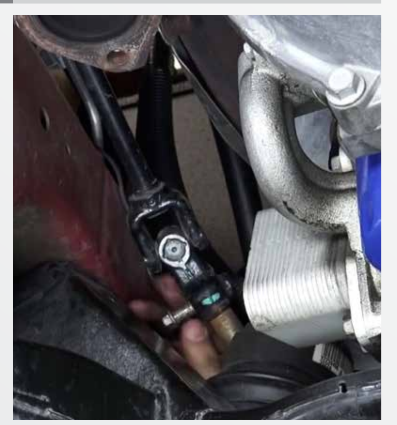
Remove the bolt on the steering u-joint at the rack and pinion shaft. Slide the shaft up into itself. Position the headers onto the head from underneath the vehicle and install 2 bolts to hold it in place.

From above, install the supplied gaskets and header bolts then tighten.